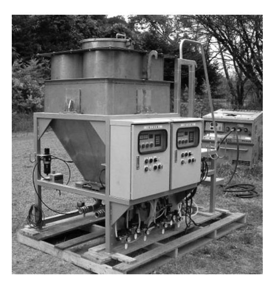
Fig. 5 Loading machine of granular emulsion explosives.

The loading machine of granular emulsion explosives has been developed for underground construction with concept of simple mechanism. The loading machine is shown in Fig. 5. Granular emulsion explosives are blown through the loading hose of 30 m to bore holes by compressed air. The pressure of compressed air can be changed easily to vary the loading density of granular emulsion explosives.