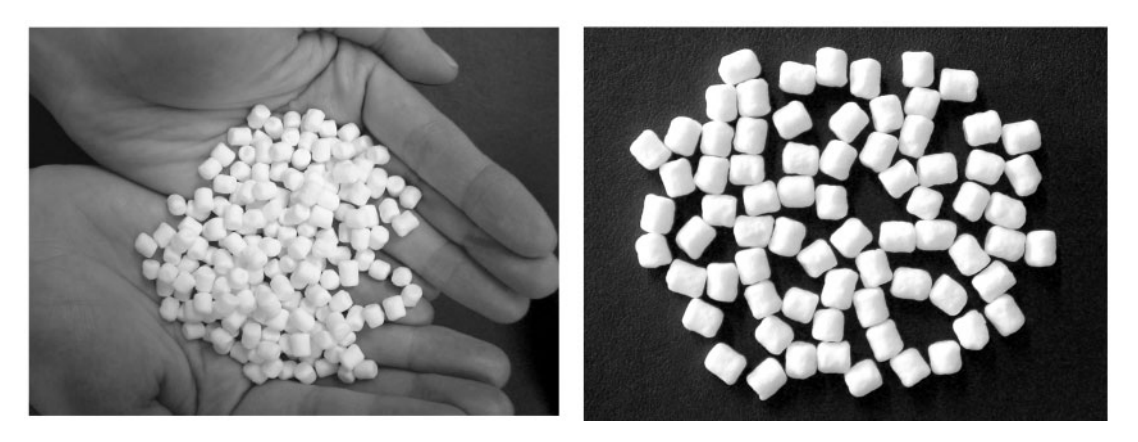
Fig. 1 Granular emulsion explosives (Diameter: 4 mm, Length: 4 mm).